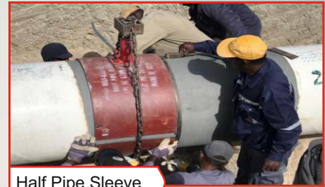
Half Pipe Sleeve