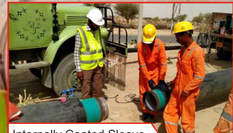
Internally Coated Sleeve